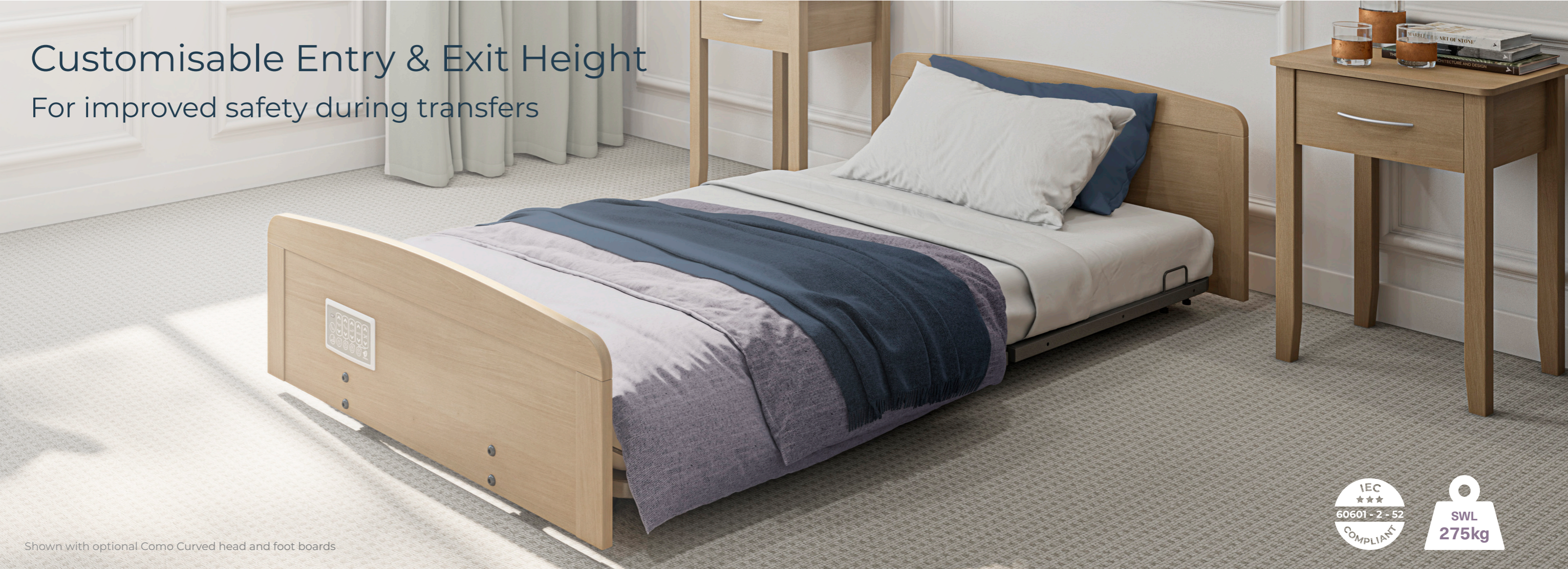
Shown with optional Como Curved head and foot boards

Customisable Entry & Exit Height For improved safety during transfers