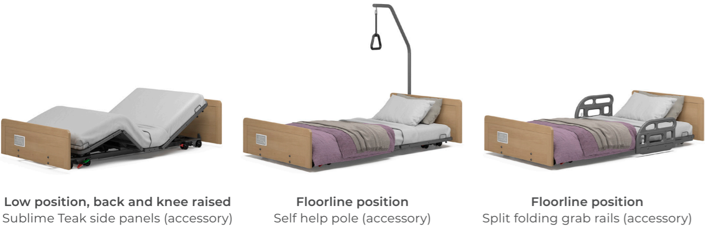
Low position, back and knee raised Sublime Teak side panels (accessory)